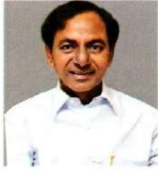
K.CHANDRASEKHAR RAO CHIEF MINISTER