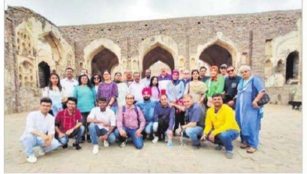
గోల్కొండ కోటను సందర్శించిన విదేశీ ప్రతినిధులు